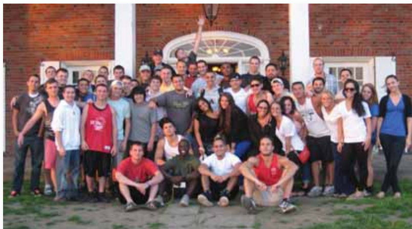
Our men at West Virginia in front of their house with the ladies of Alpha Xi Delta