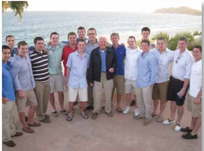
Never a bad photo moment in Cabo, as our men from Illinois Delta prove