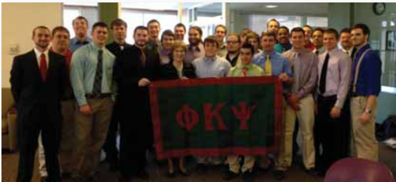
Phi Psi at Muskingum proudly carries the Phi Psi name around campus