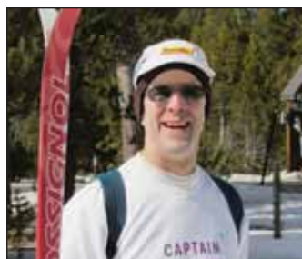
Service in Action page 6