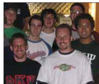
Tales of the Road Warriors page 8