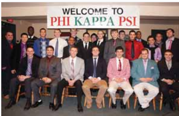
Our men at Toledo stretch the color boundaries of high fashion