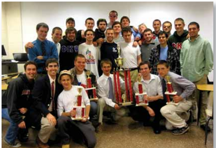
Show us your hardware! Phi Psi at Maryland proudly displaying some awards.