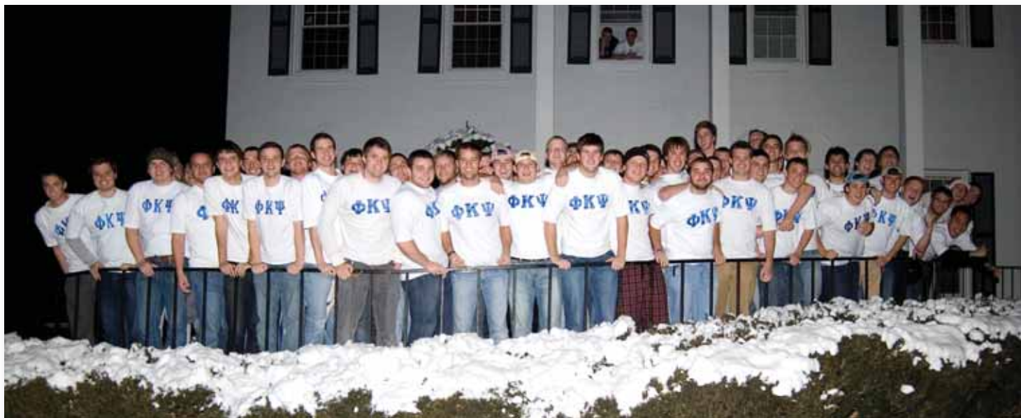
Phi Psi at Creighton is not phased by the snow for a group picture