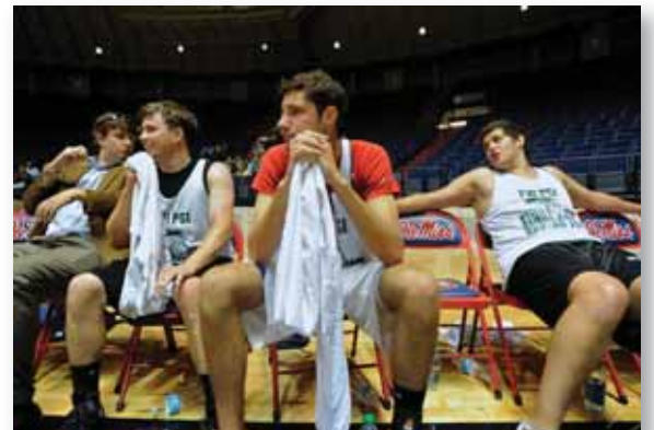
Our chapter at Ole Miss coordinated a four-team basketball tournament on campus