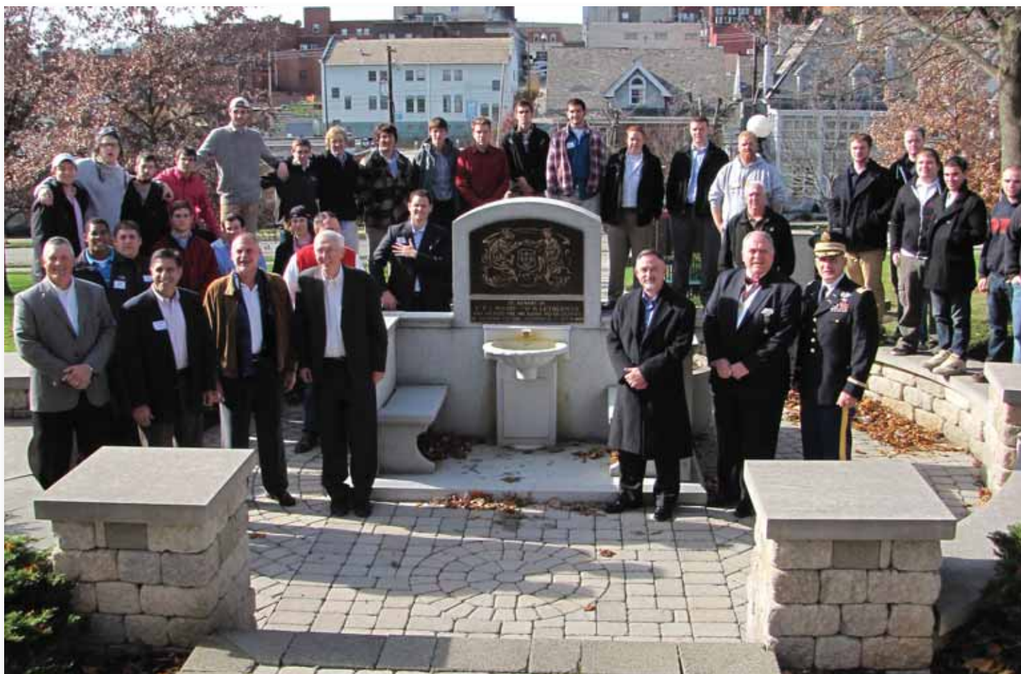
The American Leadership Academy conducted regional workshops in the fall, stopping for a historic photo with the men of Pennsylvania Alpha