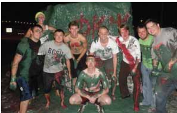
The mission at Bowling Green was to get as much paint on their clothes as the rock. Too close to call!