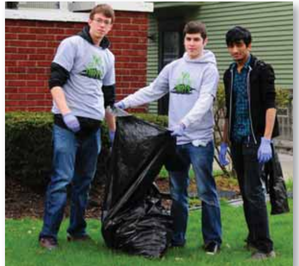
Buffalo is a cleaner city thanks to the men of New York Eta