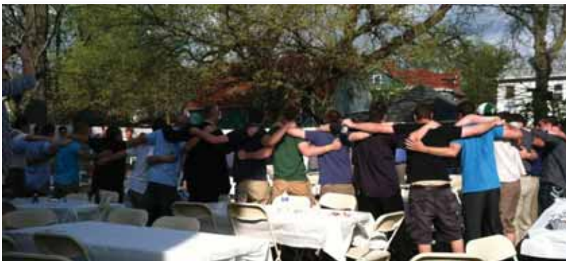
It is hard to believe that our chapter at Indiana State has been around for a quarter of a century. The brothers capped the weekend by singing Amici.