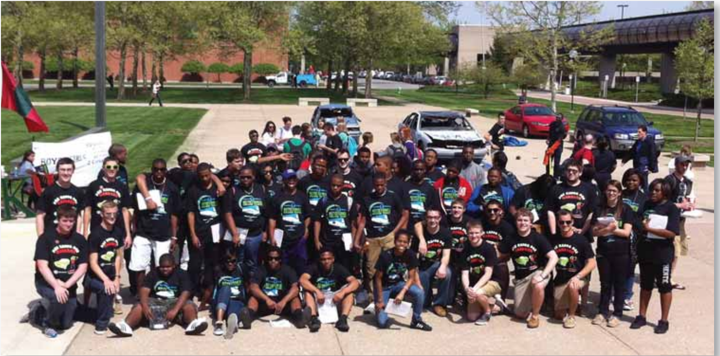
An annual tradition, the IUPUI chapter bashed a few cars to raise money for local charities