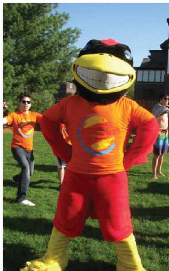
The Iowa Beta event "Phi Psi Sliders" was so big in year number two that Cy, the Iowa State mascot, showed up rocking an event shirt.