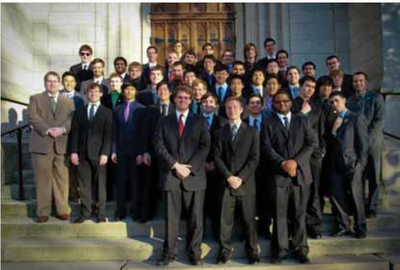
Dust off the suit in Cleveland. It's initiation day for Ohio Epsilon