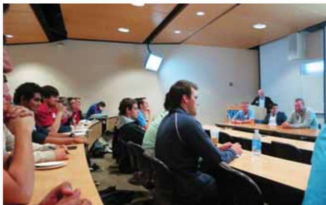
Undergraduates from RIT listen intently to a panel of alumni about mastering the job market after college