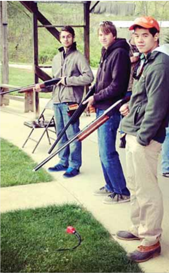
Recipe for a good event: Invite your dad, take him trap shooting with your fraternity, plug your ears. Ohio Nu with a successful outing.

Semester is Beloit College's 'off' semester in terms of recruitment, we recognize the importance of maintaining our strength by bringing in a solid pledge class. We look to continue chapter tradition of holding leadership positions within student government, also keeping our well-earned reputation for hosting great social events. Our ties with local service organizations continue to grow and the chapter has increasingly focused on setting up joint philanthropy events with other Greek houses on campus. ■