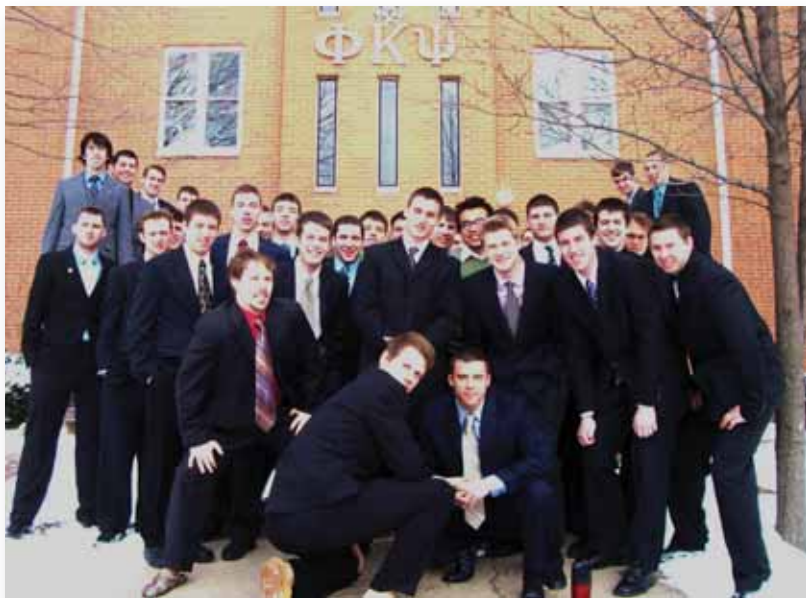
The Valparaiso Phi Psis strike a pose