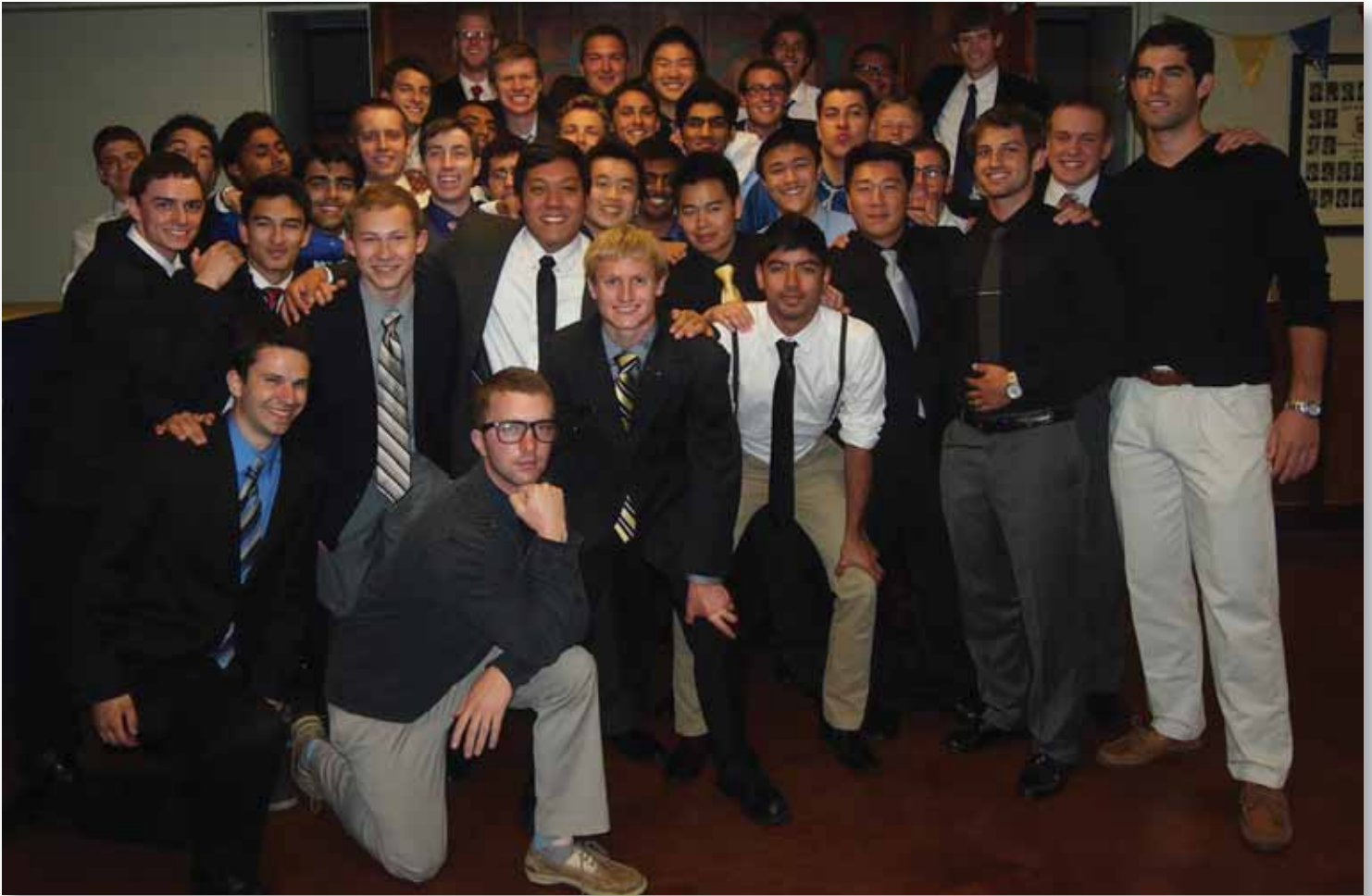
All dressed up, an astute looking group from our California Gamma chapter