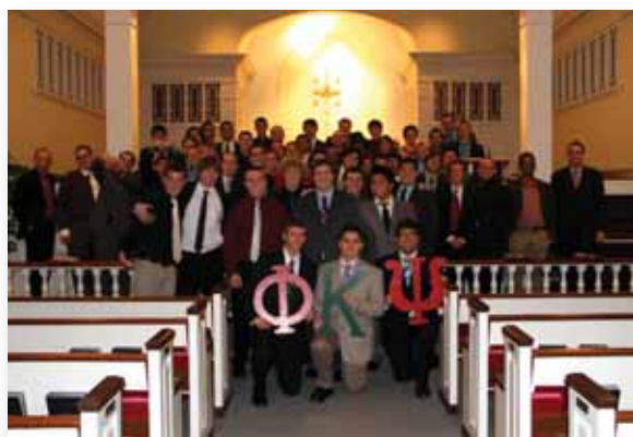
The strong get stronger as our newest Grand Chapter, New Jersey Epsilon, initiated their spring class