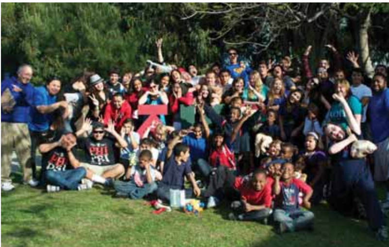
Members of our chapter at Long Beach gather with their local Boys & Girls Club.