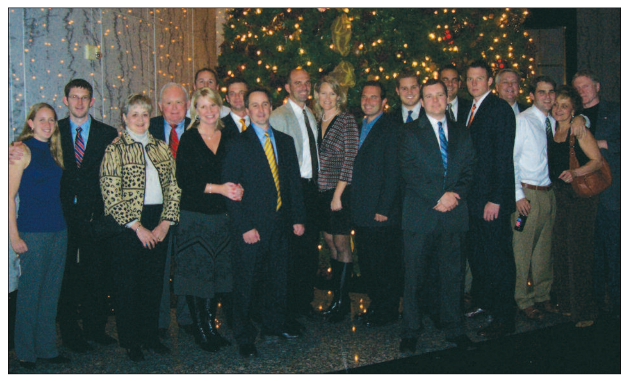
Charlotte A.A. members and guests in a festive mood during the holidays.