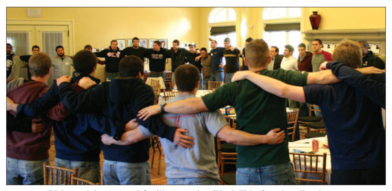
PLA participants and facilitators sing "Amici" before heading home.