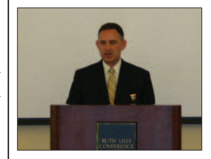
Speakers Bureau page 4