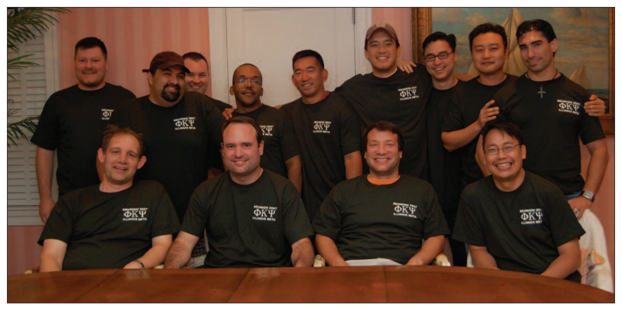
Alumni of the Illinois Beta remain close even though the chapter has shut its doors.

Dewey, Del. to rekindle existing relationships, establish new friendships and share fond memories. This gathering is proof of the "Live Ever Die Never" spirit of Illinois Betas. Expect to hear more from these proud Phi Psis in the future!