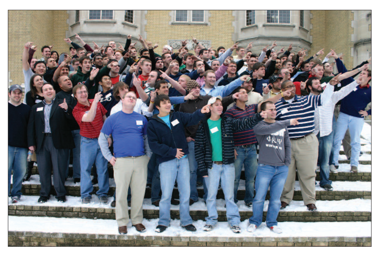
Our participants don't always know where they're going, but PLA helps give each Phi Psi leader his own direction.

Undergraduate Participants Learn How To Lead The Phi Psi Way