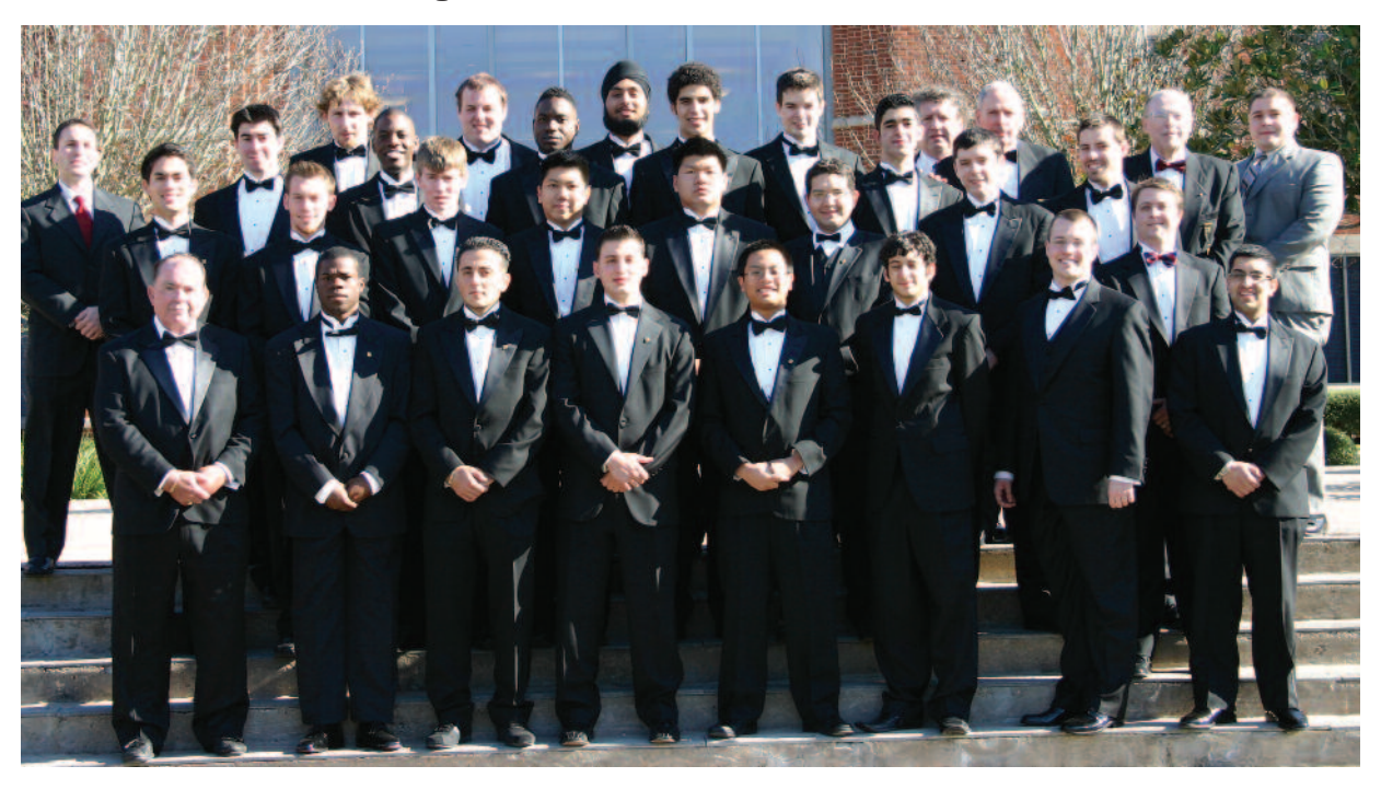
Newly initiated Texas Zetas pose with Executive Council members and alumni.