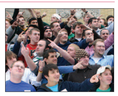
PLA Wrap-Up page 8