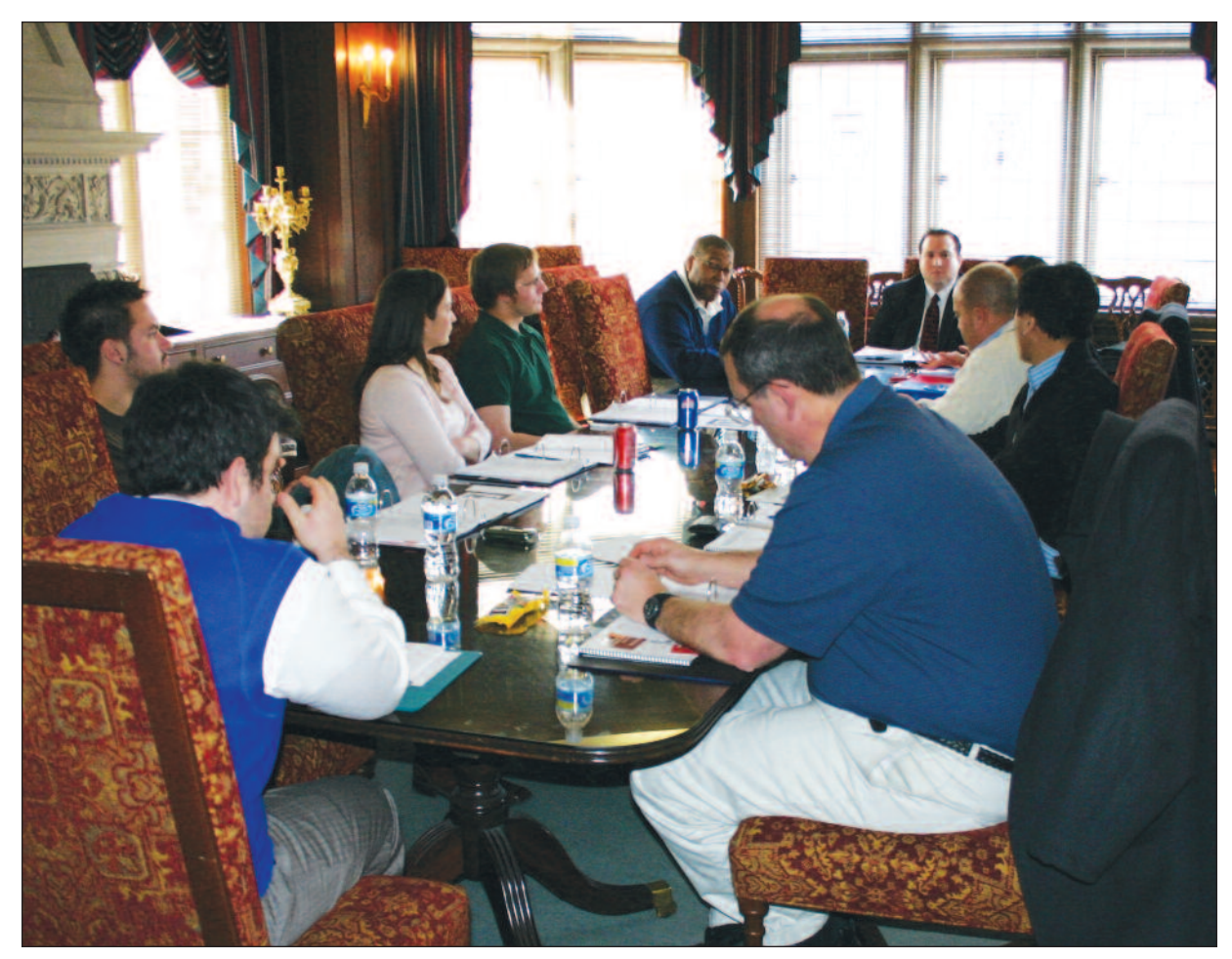
The PLA couldn't be a success without the diligence of small group facilitators, who are trained before the program begins.