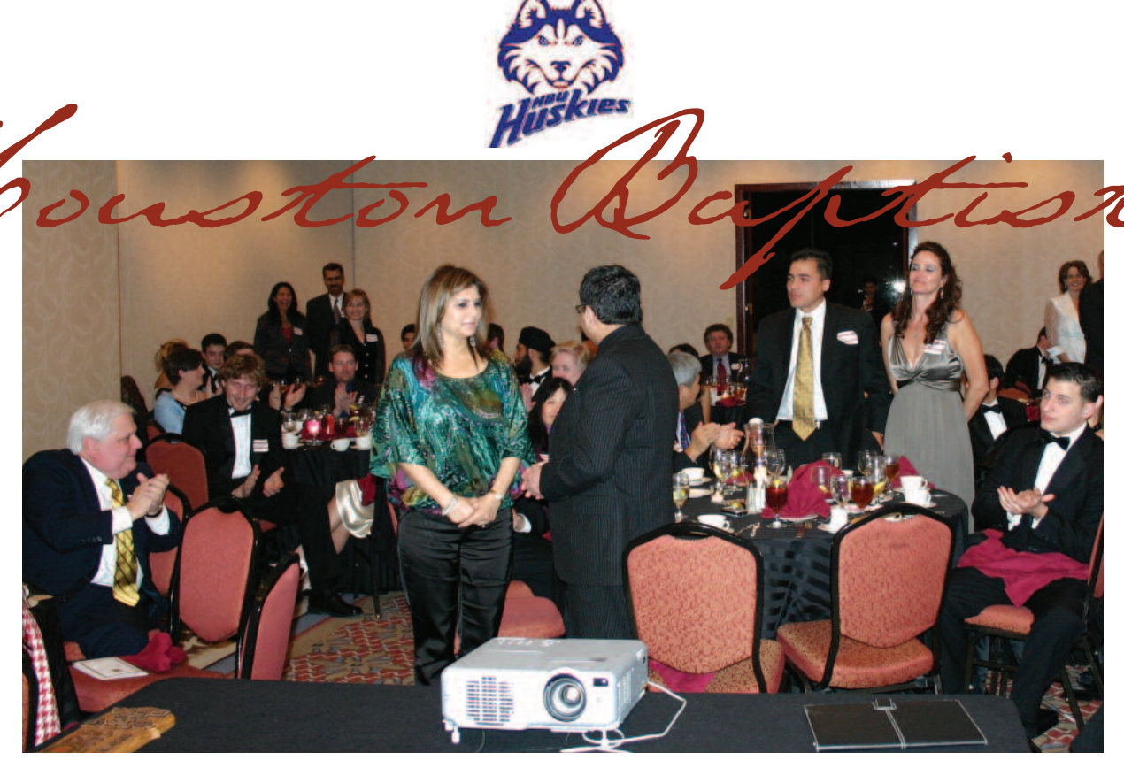
Parents, alumni and guests help Texas Zeta celebrate its recognition as a full-fledged chapter of Phi Kappa Psi.

We expect that these new groups will achieve what other chapters around the nation are experiencing – sustainable growth, recognition through Greek and student life as outstanding organizations, individual awards and involvement on campus. Congratulations to Texas Zeta and Ohio Nu: our newest brothers!