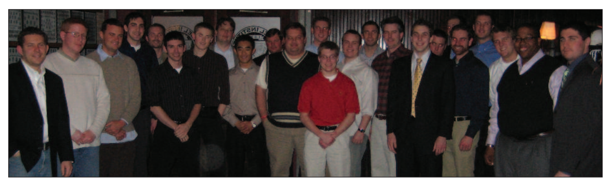
Members of the Chicago A.A. pose with undergraduates from around the Midwest during their Founders Day celebration.

Again, it was another successful year for Founders Day celebrations, and 2009 can't get here fast enough!