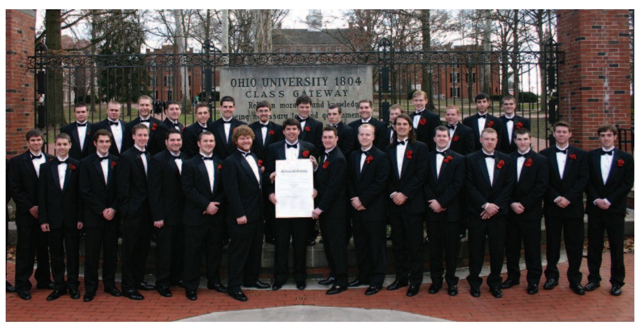
The colony that became the Ohio Nu Chapter was envisioned in front of the Ohio University 1804 class gateway.