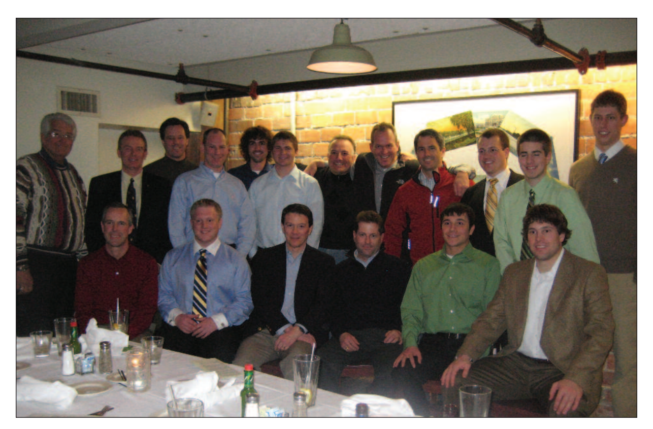
Central Iowa alumni gathered to celebrate Phi Psi's 156th year as one of America's premier Greek organizations.