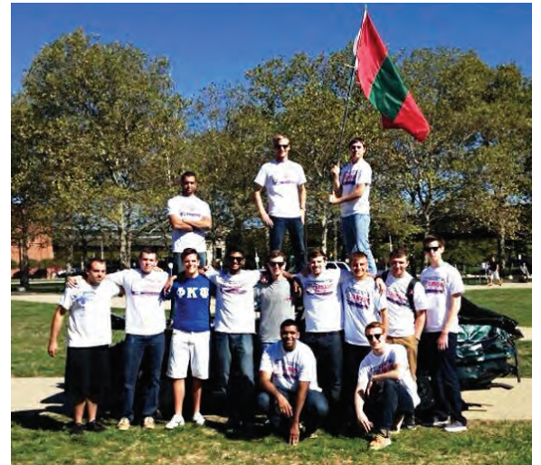
Each spring, the Phi Psi men at IUPUI help the campus bash in a car for charity and then pose afterwards