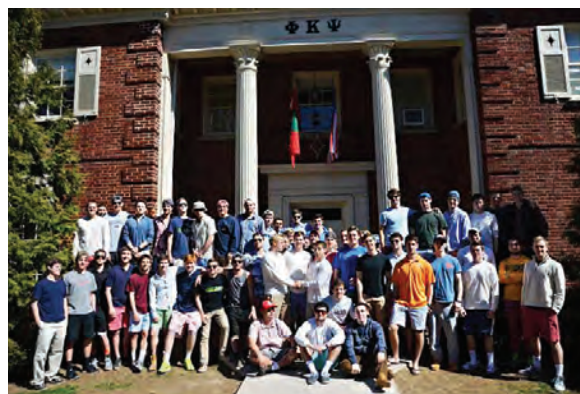
Phi Psi life at Bucknell