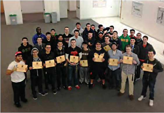
At Drexel, getting your membership certificate is worth celebrating by the entire chapter