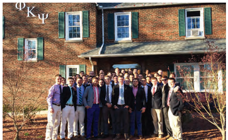
Exponential growth at Penn State has given this group plenty to smile about