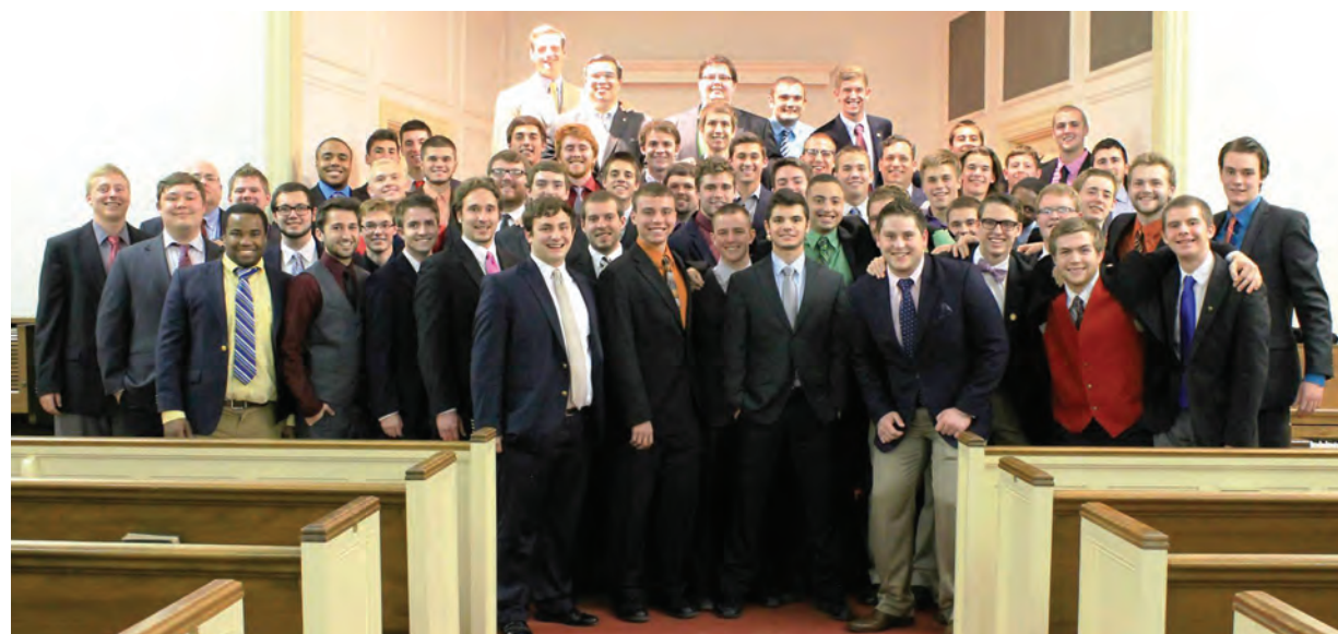
A must-have photo from Bowling Green after initiation