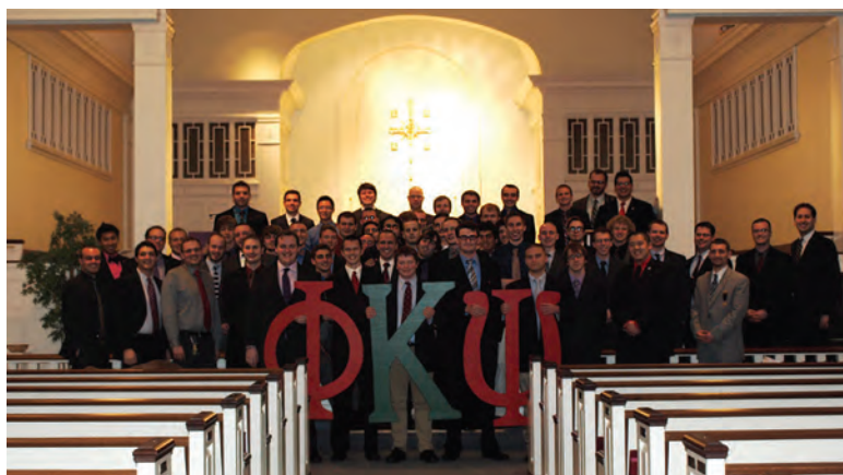
The crowd keeps getting bigger in this annual photo from New Jersey Epsilon at initiation. #growing