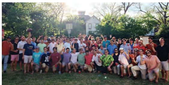
Hook 'Em, Texas Alpha