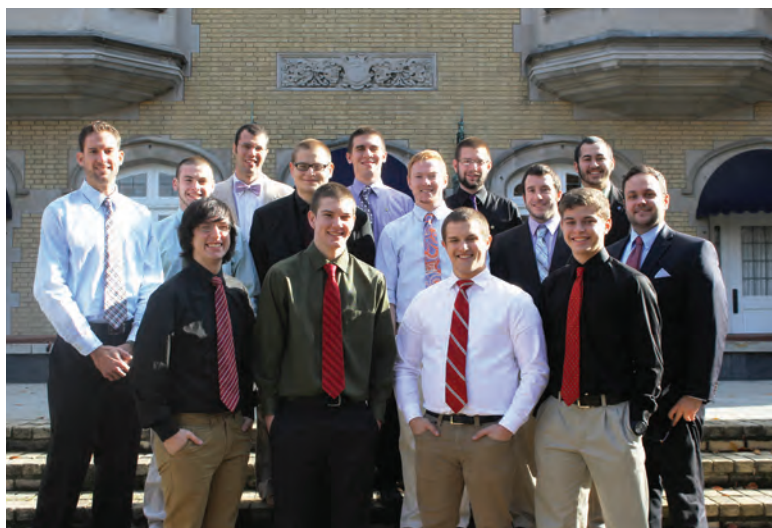
Brothers from Indiana State headed east on I-70 to Laurel Hall to welcome new members