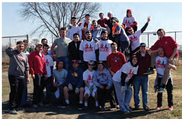
Phi Psis at Nebraska doing what Phi Psis do best