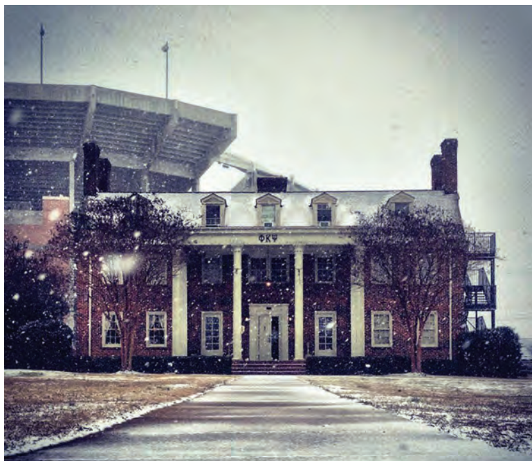
With a new house on the horizon, the snow isn't the only thing rare about this iconic shot of our Alabama Alpha house on the doorstep of the legendary Bryant Denny Stadium