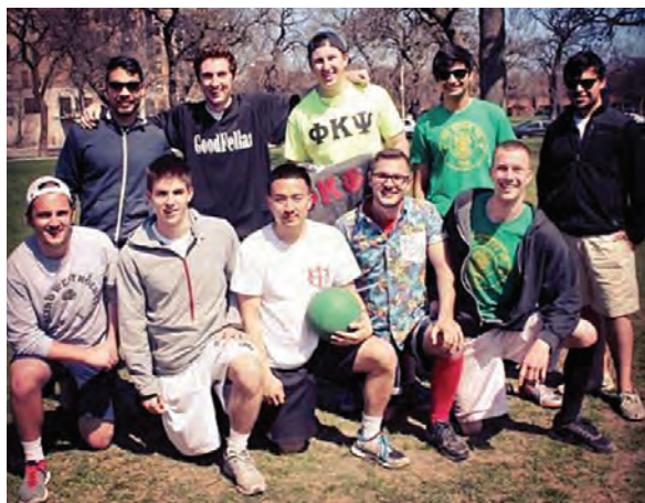
Our brothers at UIC couldn't wait to leave the Chicago winter behind and get outside this spring