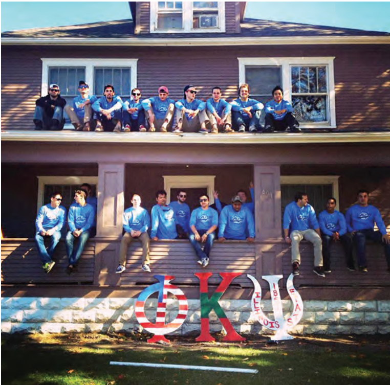
Brothers at Illinois State test the fire code for a chapter-sized picture