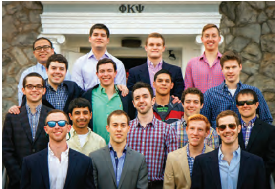
Another strong class of men at Pennsylvania Theta