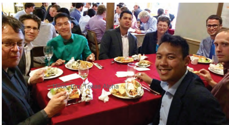
At Cal Berkeley, chapter success hinges on the interaction of alumni and undergraduates, like at this recent dinner