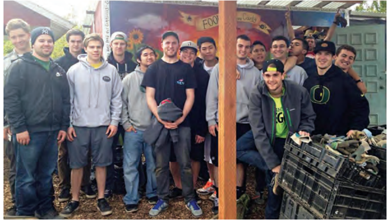
Our men at Oregon doing our founding fathers proud