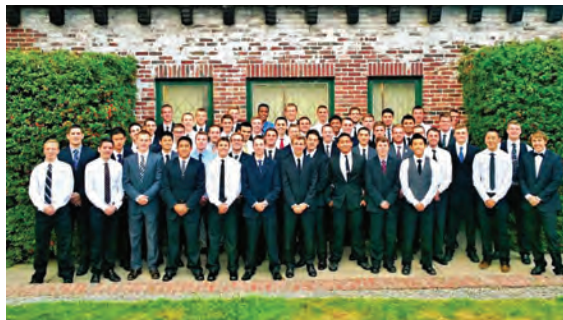
Dapper looking bunch in Washington