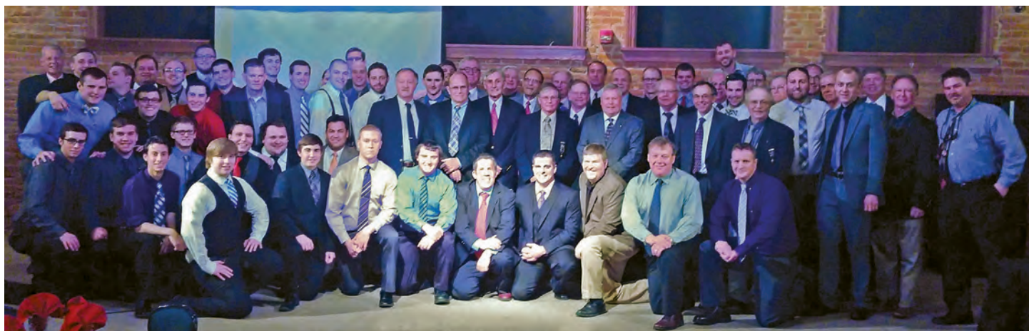
For the 45 th anniversary of the Minnesota Gamma Chapter, 75 alumni returned to Mankato to celebrate a great legacy