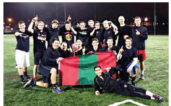
If the newsletter from Minnesota didn't have you convinced of the athletic dominance, there is photographic proof!