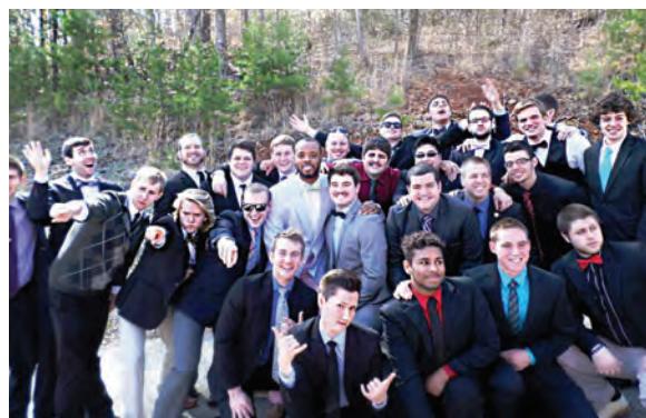
Our men at Toledo looking to become the best dressed group on a nature hike, or maybe they stepped outside for a quick "groupie"