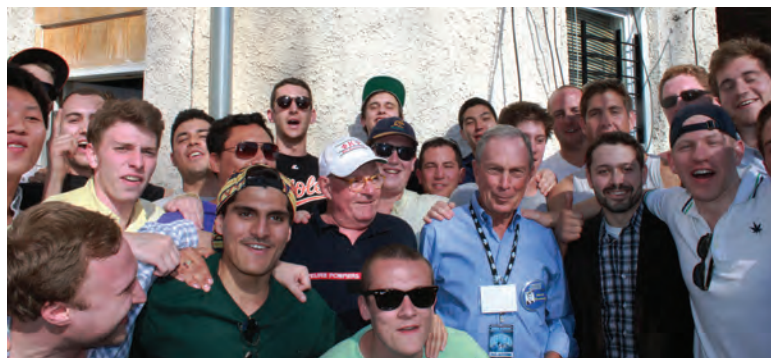
The brothers at Johns Hopkins came out in force to welcome back one of their own, Michael Bloomberg, as he returned for a reunion year