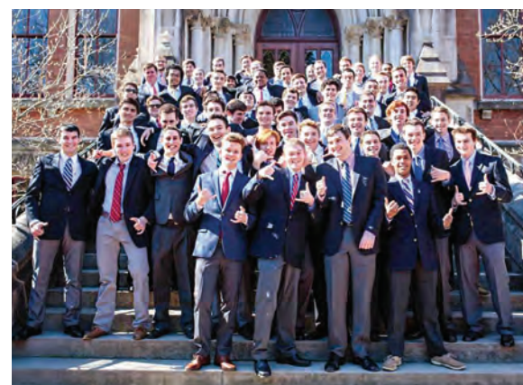
Time has flown by since the return to Vanderbilt, just ask these guys.