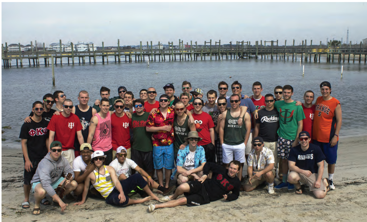
Our men at York College