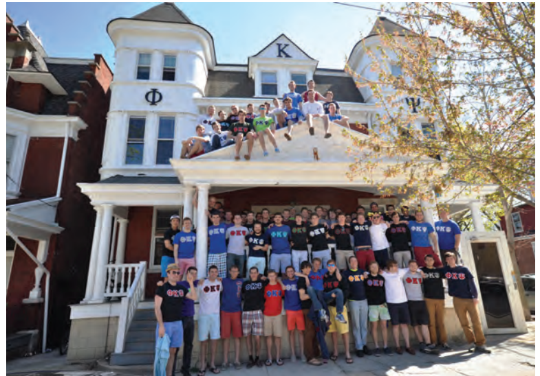
In case you were wondering, yes, our men at Franklin & Marshall stole your block-lettered t-shirt