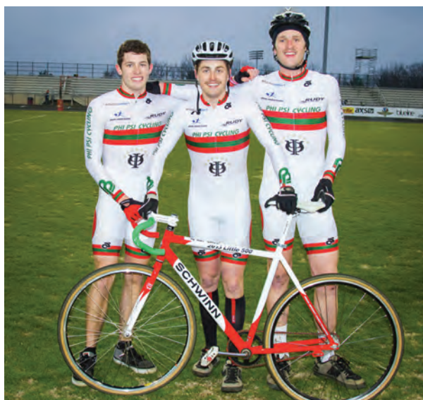
The Little 500 Phi Psi team at Indiana had some mechanical issues during the race, but boy were they dressed to win!