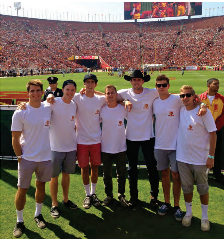
Members of our chapter at Southern Cal pretend to pose for a photo while secretly stalking the USC Song Girls