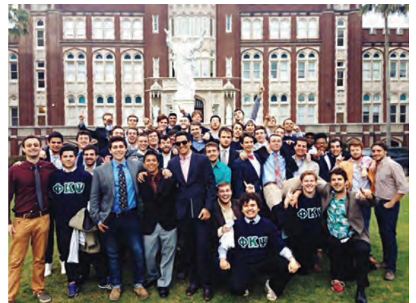
Good lookin' crew in the Big Easy at Louisiana Gamma