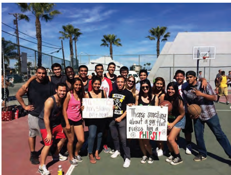
They got game at Long Beach